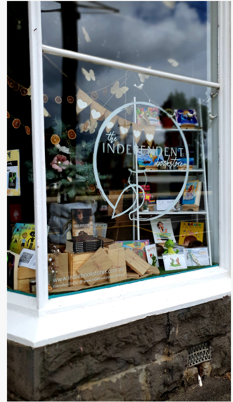
"A glorious read!"