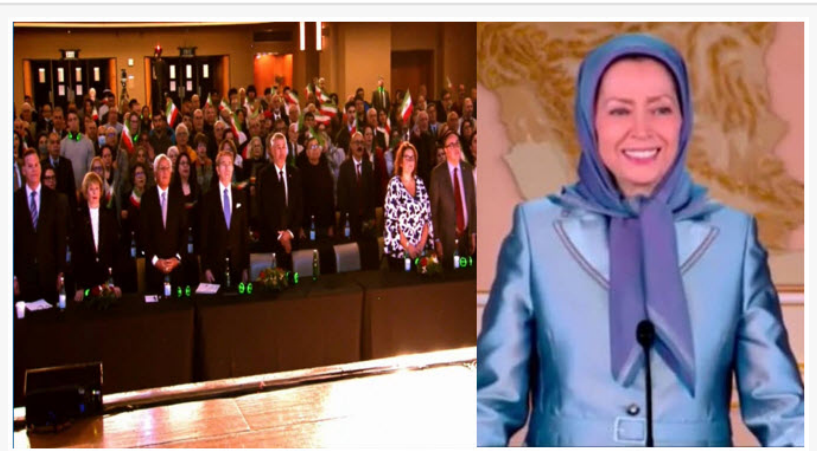
Maryam Rajavi, the President-elect of the National Council of Resistance of Iran (NCRI), addressed the audience online as the keynote speaker and presented a number of policy recommendations for Canadian lawyers and the gov. vis-à-vis the Iranian regime.

“We’re not standing in the streets with them, but we all have a voice. You don’t have to be Iranian to have a voice, you have to care about democracy and human rights, and it’s imperative as parliamentarians that we talk to our friends and talk to our neighbors, educate them, talk to them about just what kind of persecution is going on there,” she added.