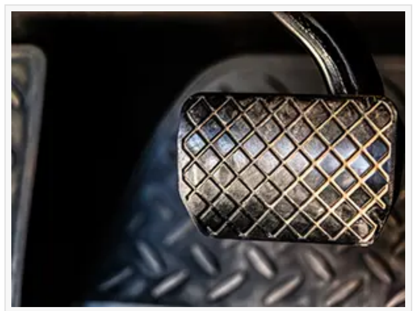
Drivers need to know how their driving style is effecting their vehicle to help reduce premature repairs.

People who are always in a hurry and rushing around town are likely to use their brakes more often. Slow traffic, red lights, and cops never let anyone just speed through town without interruption. Those who drive faster