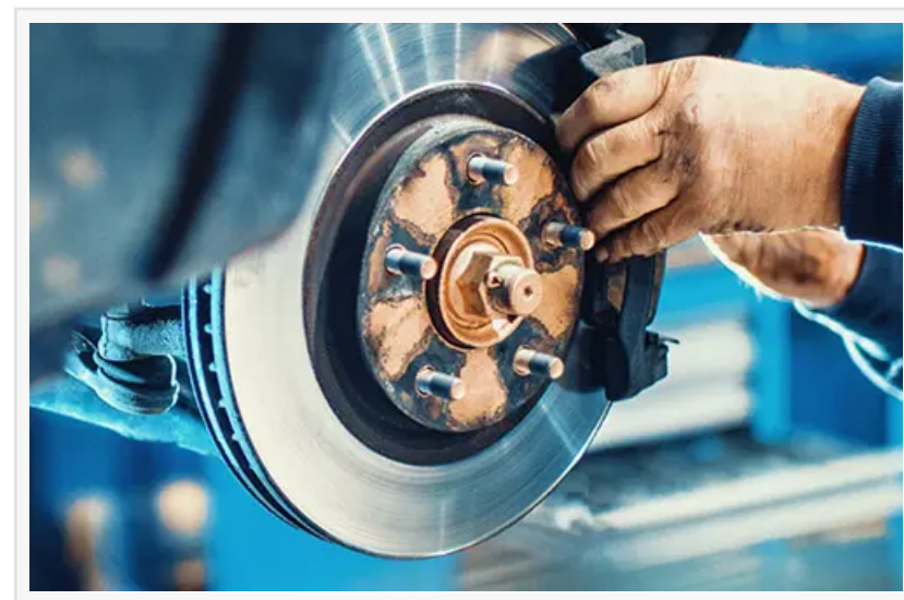
Along with brake repairs, Ford Service Coupon can people save on oil changes, tires, and so much more.

Tailgating is a risky business all around. It is a quick and easy way to end up in an accident. It can take a toll on a car's brake system because the tailgater is