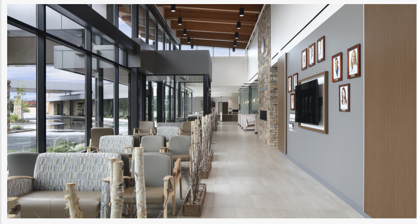
The waiting room is a warm and welcoming environment that is filled with natural light.

The 24,000 sq. ft. surgery center maintains an independent patient entrance and provides five 600 sq. ft. operating rooms, six private pre-op rooms, five post-op bays, and four flex rooms. The operating rooms are nearly