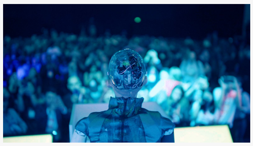
Sophia, Closing Night Film For AmDocs 2023