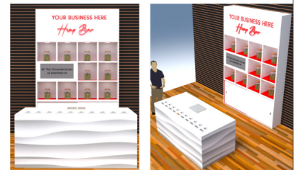
Counter and Display

Experience the future of CBD retail with hhemp.co's innovative Hemp Bar solution