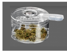
Custom Smell Jar