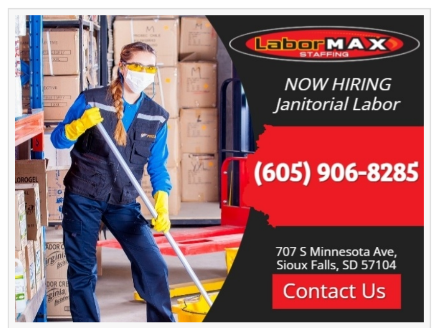
Hiring in Sioux Falls, SD