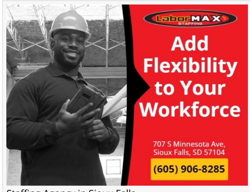
Staffing Agency in Sioux Falls

The fourth tip that was mentioned was influx of new techniques and ideas. "Your temporary staffing agency gives you access to workers with new skills and ideas you and your team might not otherwise have access to that can