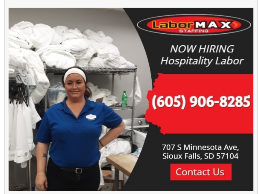
Now Hiring in Sioux Falls