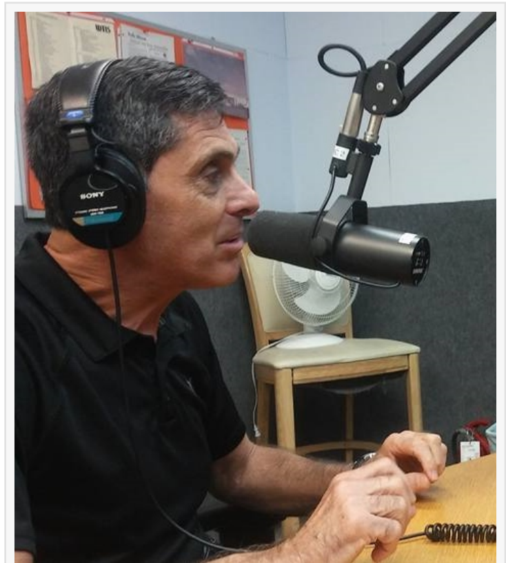
Author Steven Sherman

specific details which unveil the future of the nation of Israel, unbelievers, and the body of Messiah. THE REVELATION OF JESUS CHRIST: Understanding the Apocalypse is a unique verse-by-verse account of the Book of Revelation viewed from a Hebraic Mind-set.