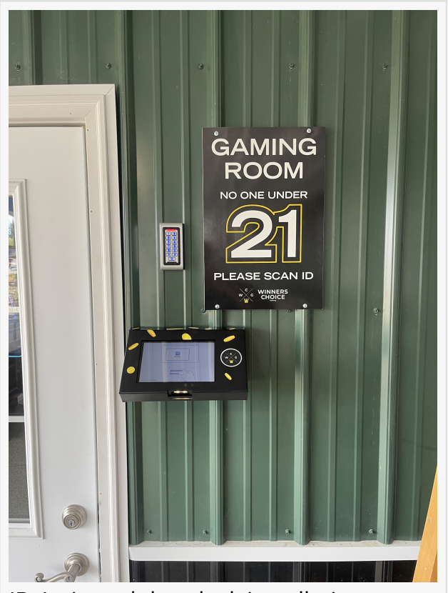
ID Activated door lock installation on the gaming room at an Illinois grocery store

The global slot machine market is expected to grow by $9.77B between 2022 and 2026. Illinois legalized video gaming in July 2009. There are now nearly 8,500 licensed establishments housing video gaming machines. These establishments are largely <u>bars and</u>