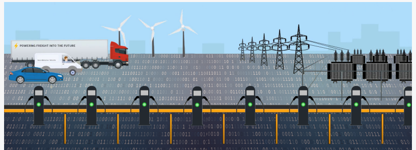
Terbine & IBM NEVI Webinar Series

leader IBM today announced a webinar series designed to give state and local officials, engineering firms and contractors the education that they require to design, implement and operate EV charging networks. The series will kick off on March 7th at 8AM Pacific / 11AM Eastern. All sessions are virtual and free to attend. The initial