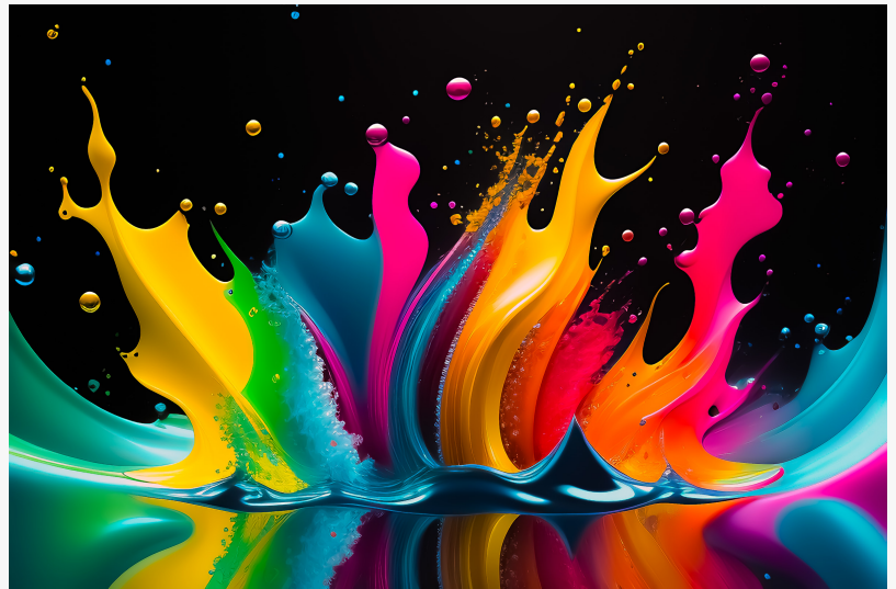
AI Art featured on Nextomoro.com

/EINPresswire.com/ -- In a rapidly evolving world where technology continues to shape the way people live, work and interact, a new voice has emerged to provide insightful and comprehensive coverage of the artificial intelligence industry. This voice is nextomoro.com, a revolutionary new website launched this year dedicated to all things artificial intelligence.