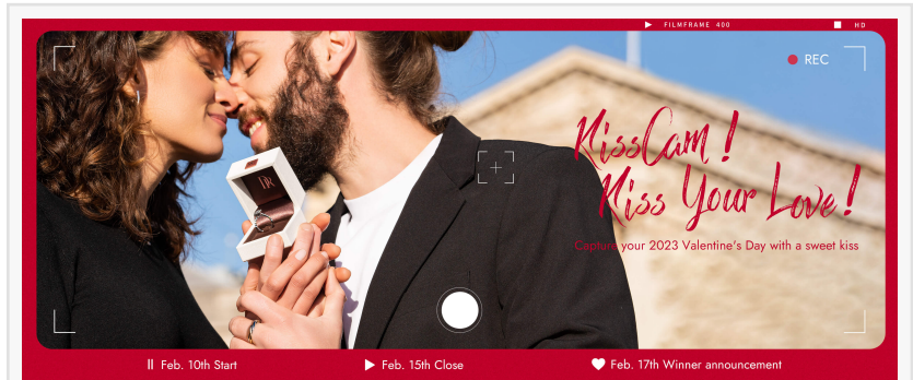
DR Kiss Cam Contest