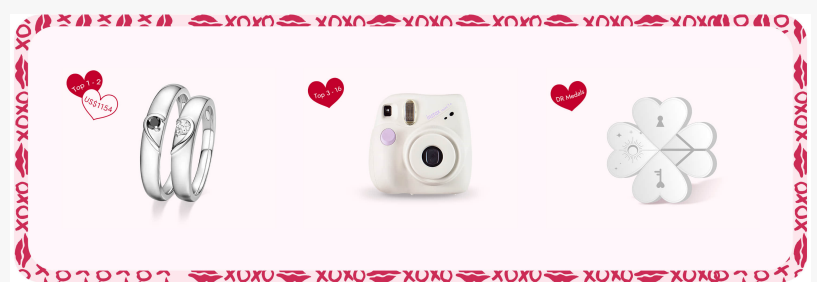
DR Kiss Cam Prizes