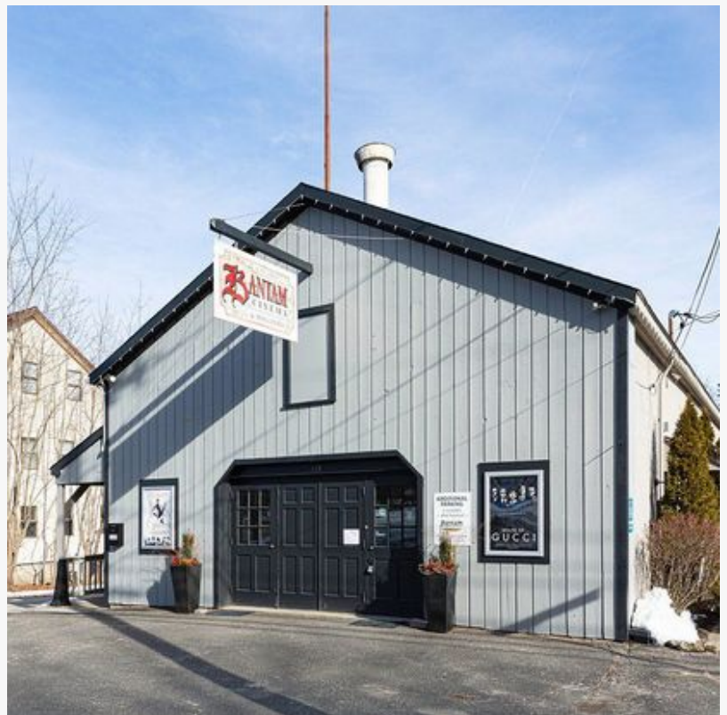
From View of Bantam Cinema & Arts Center, Bantam, CT