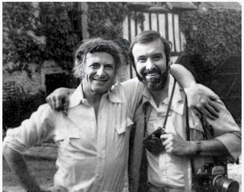
Marcel Marceau and Ben Martin