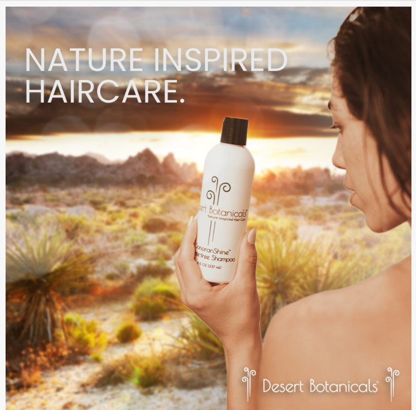
Desert Botanicals - The Home of Nature Inspired Hair Care