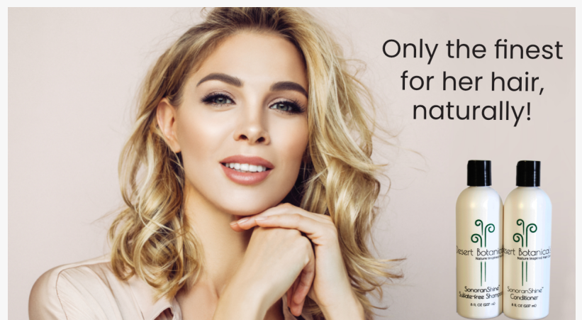
Desert Botanicals - Nature Inspired Hair Care for a luxurious look and feel