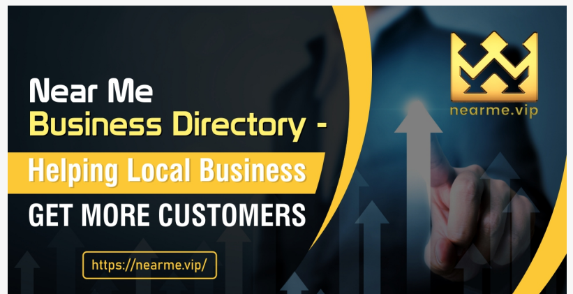
Near Me Business Directory - Helping Local Business Get More Customers