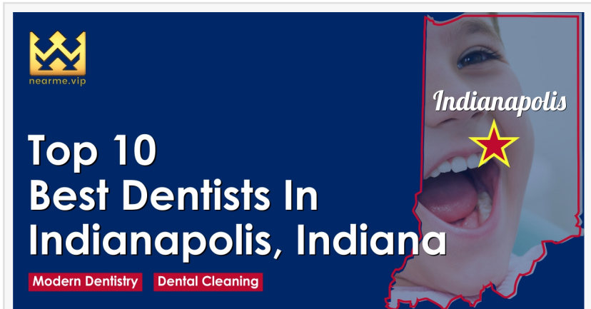
Top 10 Best Dentists in Indianapolis, Indiana

Martin Dentistry is committed to delivering care of the most excellent possible quality to those in need of