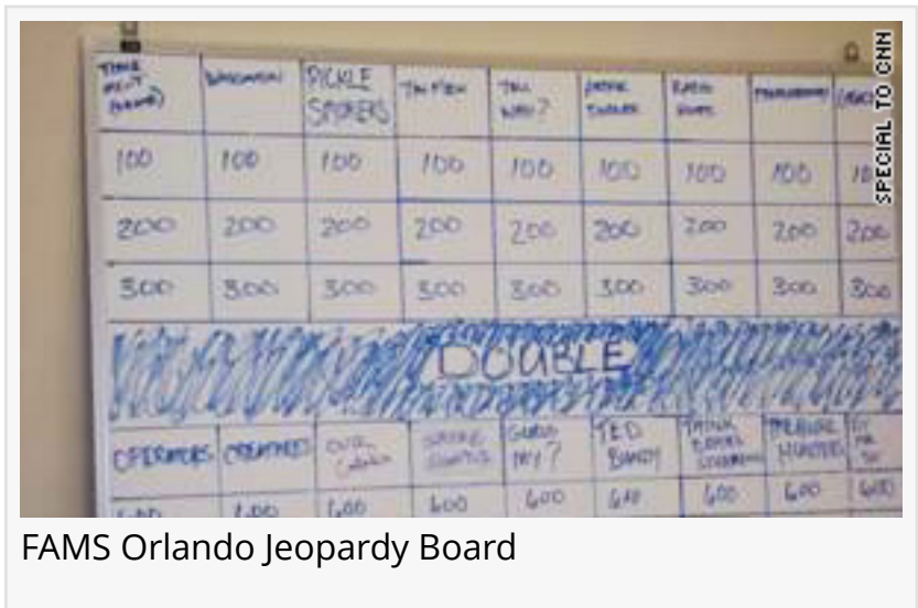
FAMS Orlando Jeopardy Board

threats of terrorism and other events that pose a high risk to homeland security such as natural and unintentional introduction of diseases, pests, or poisons. For example, evidence suggests terrorists have considered targeting people by adding toxic chemicals and pathogens 1 directly to the food supply. To illustrate, following the September 11, 2001 terrorist attacks, the U.S. military found a list of pathogens in an Afghanistan cave that Al-Qaeda planned to use as potential biological weapons to target humans and the food supply."