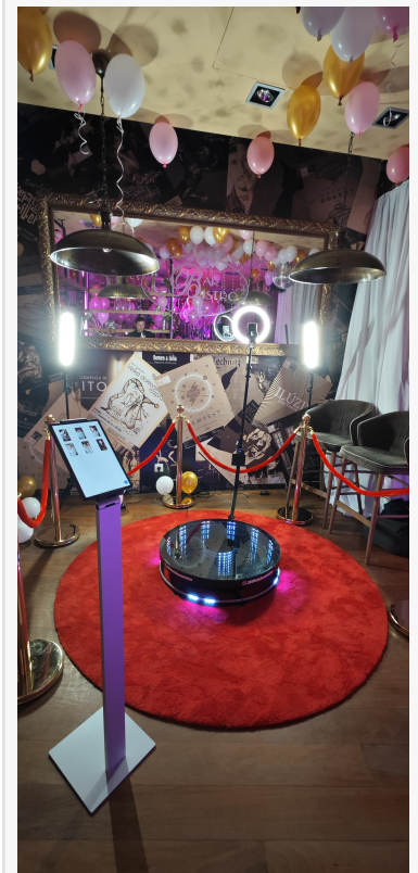
Videobox red carpet video sharing station