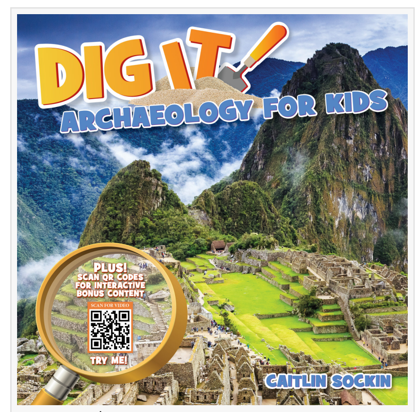
DIG IT! Book Cover

CARY, NORTH CAROLINA, USA, February 9, 2023 /EINPresswire.com/ --DIG IT! takes young readers on a global tour of the field of archaeology, pausing along the way for glimpses into the past lives of people in ancient civilizations across the globe throughout time. Stops at famous and not-so-famous archaeological sites bring to life archaeology topics, methods, and rules by showing how they were used at each discovery. These edutaining, real-life examples are accompanied by beautiful visual spreads, many of which include QRcodes that readers can scan with a smartphone or tablet to watch drone fly-over videos of archaeological sites and demonstrations of dig techniques.