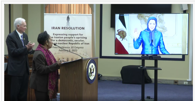
NCRI President-elect Maryam Rajavi joins a bipartisan congressional press briefing on Feb 8, 2023, hosted by Rep. Tom McClintock (R-CA) & also attended by Rep. Sheila Jackson-Lee (D-TX), to introduce H.Res.100, supporting Iran uprising for a democratic, secular

"Once again, I want to commend you all for this very important bi-partisan congressional