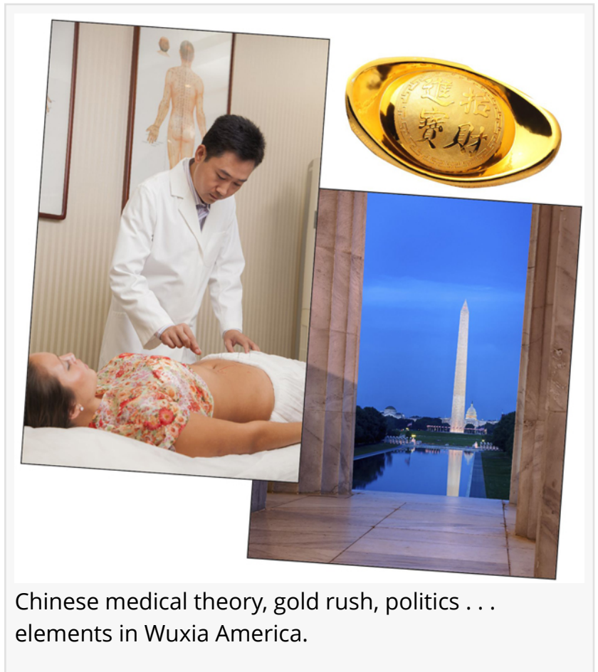
Chinese medical theory, gold rush, politics . . . elements in Wuxia America.

This press release can be viewed online at: https://www.einpresswire.com/article/615974736 EIN Presswire's priority is source transparency. We do not allow opaque clients, and our editors try to be careful about weeding out false and misleading content. As a user, if you see something we have missed, please do bring it to our attention. Your help is welcome. EIN Presswire, Everyone's Internet News Presswire™, tries to define some of the boundaries that are reasonable in today's world. Please see our Editorial Guidelines for more information. © 1995-2023 Newsmatics Inc. All Right Reserved.