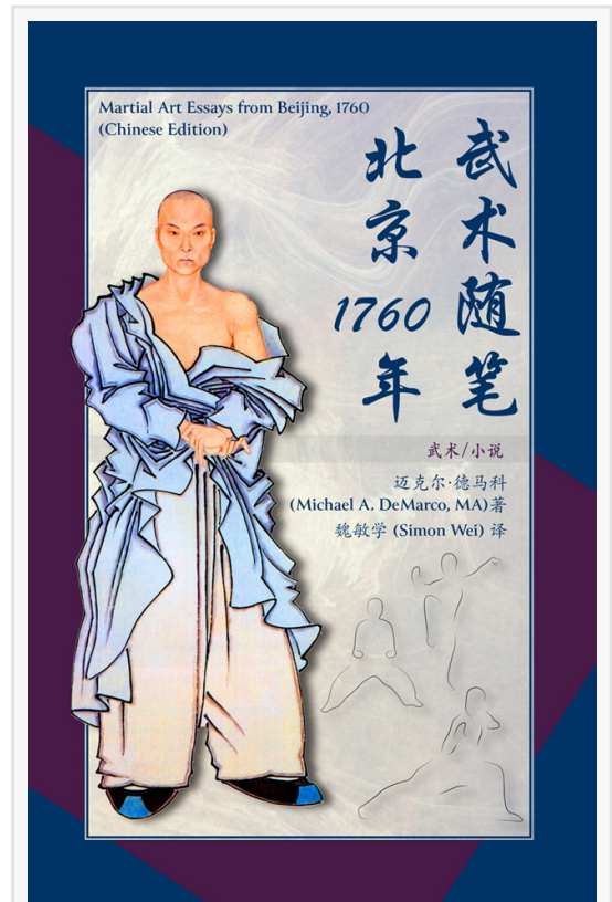
Front cover of Martial Art Essays from Beijing, 1760