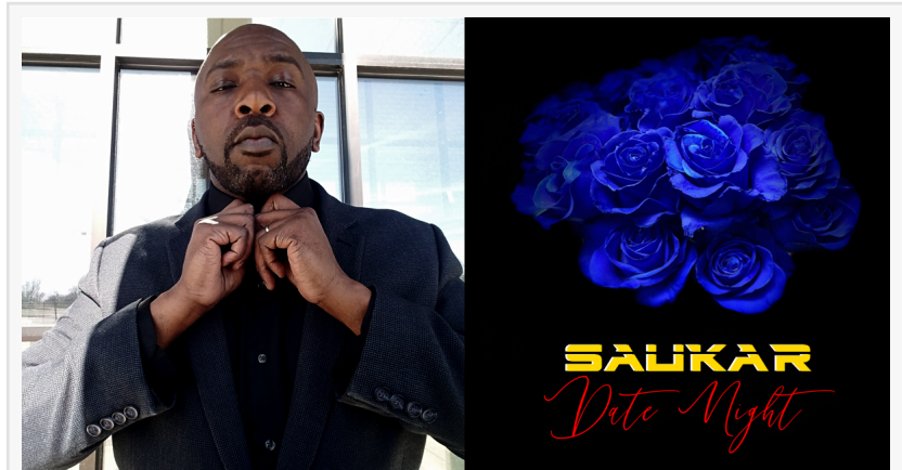
Let's go on a "Date Night" with Saukar

With clean lyrics that delve into declarations of attraction, companionship, and embrace, "Date Night" is not only perfect for couples who celebrate the spirit of love, but also for individuals who long for music that contains depth. Not only is Hip-Hop the prevalent back beat, but it also contains pieces of Rhythm and Blues, Reggae, Afrobeat and EDM as well. Saukar not only performed as the rapper, but also was the sole composer, producer, & engineer; which shows the commitment that he is willing to give to his vision.