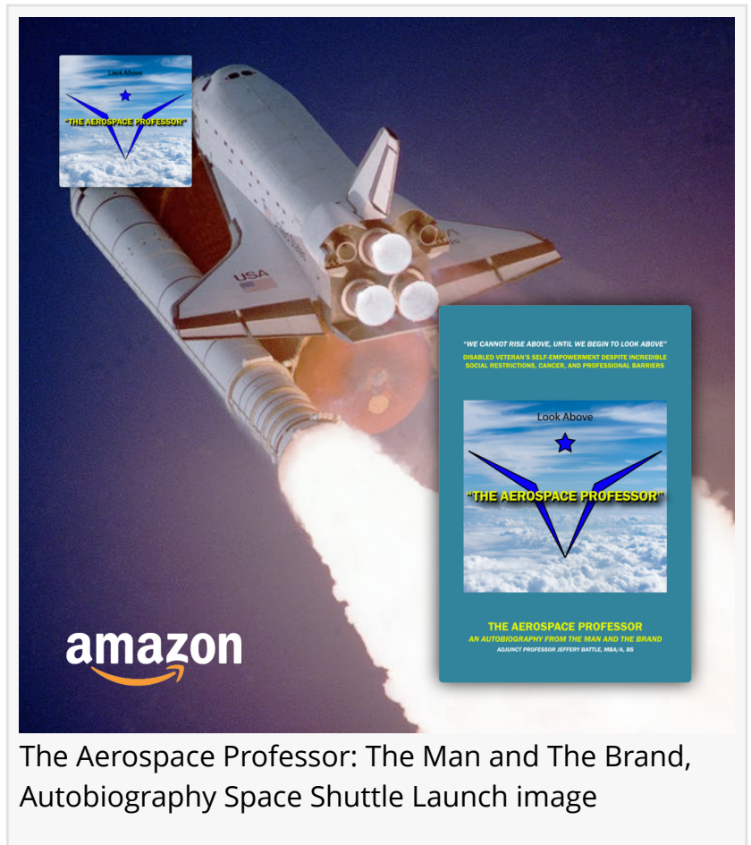
The Aerospace Professor: The Man and The Brand, Autobiography Space Shuttle Launch image

This press release can be viewed online at: https://www.einpresswire.com/article/616096712