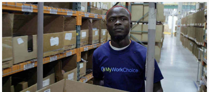
Full time hourly employees can enjoy the benefits of a flexible schedule in today's manufacturing and warehouse environments