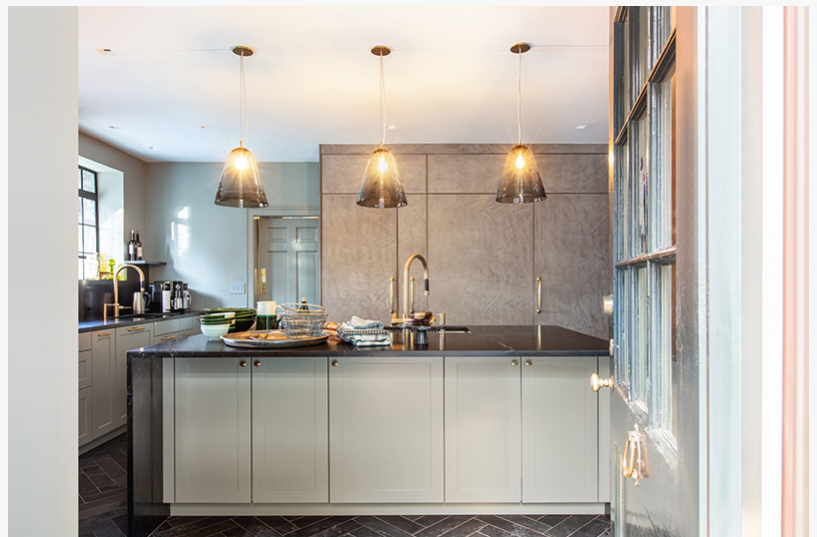
North Salem Residence and Landscape – Archi-Tectonics – – Interior