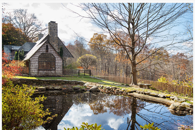
North Salem Residence and Landscape – Archi-Tectonics – Exterior

spectacular views. The choice fell on Ipe hardwood, the design with uniform planks being held perfectly straight by a delicate steel connection at the bottom, expresses the rolling hills of the property even further. This creates a beautiful rhythm, with the wood elements moving up and