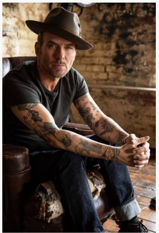
Singer & Celebrity Matt Goss

The Prost8 charity has ambitious plans to deploy at least the first two suites early this year (costing about £350,000 each) and two more before the year end. Centres such as Bath, Norwich, Newcastle, Sheffield, Fife and Wrexham are on the list, among others.