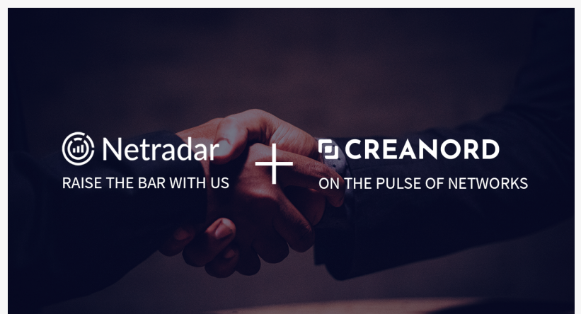
Creanord and Netradar Announce Strategic Partnership