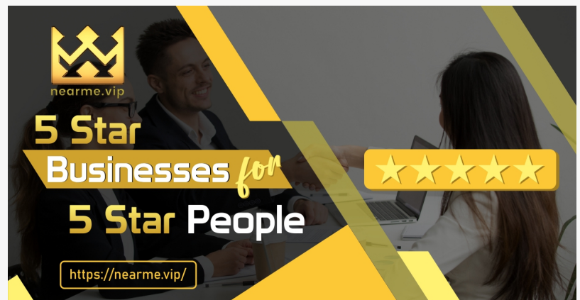
5 Star Businesses for 5 Star People