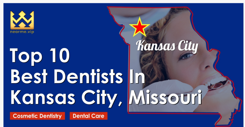
Top 10 Best Dentists in Kansas City, Missouri

Gum disease can be avoided by practicing excellent oral hygiene at home and making informed dietary decisions (for example, limiting the amount of sugar consumed). Still, regular visits to the dentist are also essential. Tooth decay happens when the protective coating of enamel that covers the teeth wears away over time. This occurs as a consequence of an acidic reaction brought about by a conglomeration of bacteria and particles from many sources, including food, beverages, and other things. A checkup at the dentist can detect the earliest stages of tooth decay and prevent further decay by reinforcing the tooth's enamel if it has become weak.