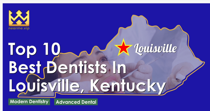
Top 10 Best Dentists in Louisville, Kentucky

Gingivitis is the name given to this condition by the medical community. It harms the tissues of the gums and causes them to get clogged. It can also result in symptoms like pain, edema, or even bleeding in the mouth. This disease can also cause the bone that holds the teeth in place to become dislodged, making tooth loss more likely.