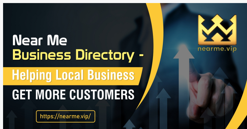
Near Me Business Directory - Helping Local Business Get More Customers