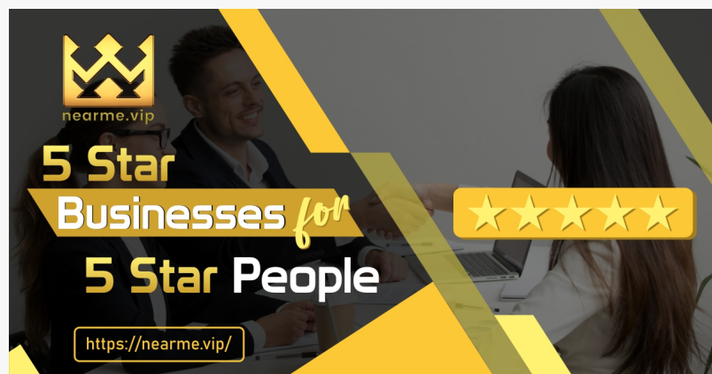
5 Star Businesses for 5 Star People