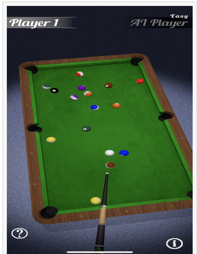
Pool Table Challenge top down view