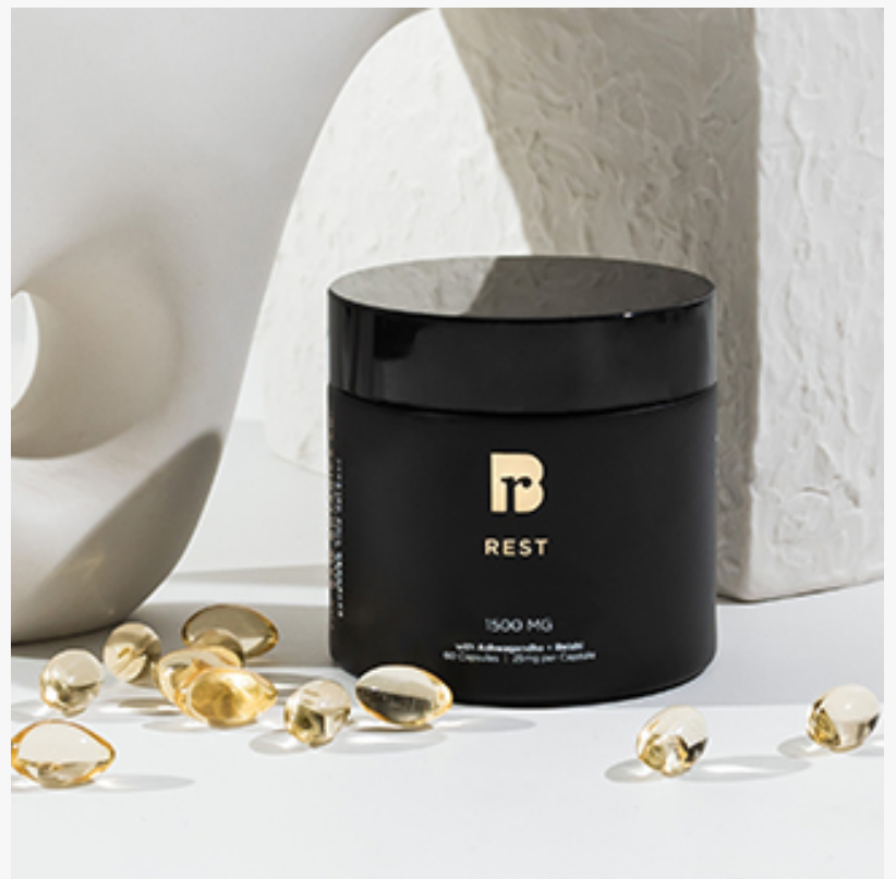
REST vegan softgels with CBD, CBD, Reishi, Ashwgandha and an additional proprietary blend of plant adaptogens

This press release can be viewed online at: https://www.einpresswire.com/article/616362204