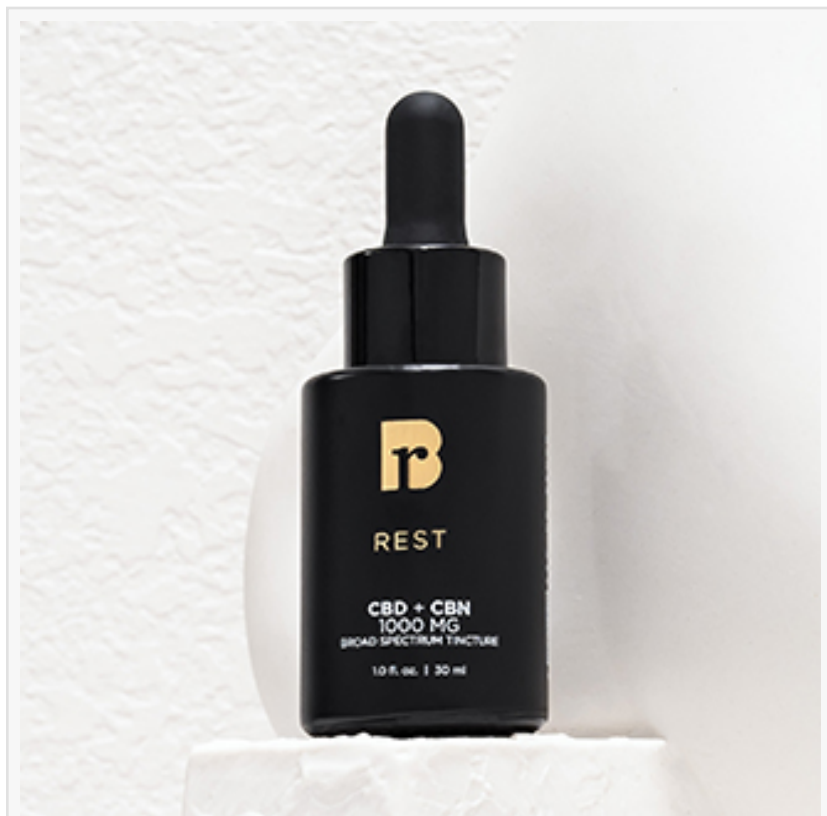
REST Tincture with CBD, CBD, Reishi, Ashwgandha and an additional proprietary blend of plant adaptogens

Raw Botanics is a cutting-edge wellness company that is dedicated to helping people live healthier, more natural lives. With a focus on premium, plant-based ingredients, Raw Botanics offers a range of products designed to support optimal health and wellness. From its carefully crafted supplements to its natural skincare line, Raw Botanics is dedicated to using only the finest, ethically sourced ingredients to create products that are both effective and safe.