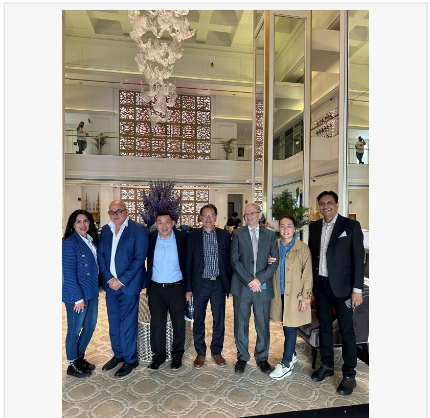
Arab Health Medical Expo 2023

Arab Health & Medical Expo is the largest healthcare exhibition and conference in the MENA region. The event includes new healthcare transformation topics, attracting many of the world's