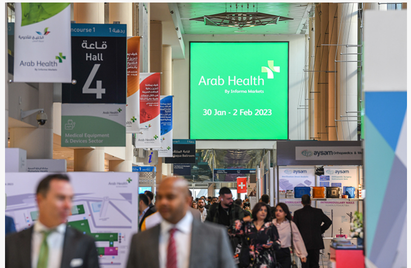
Arab Health Medical Expo 2023