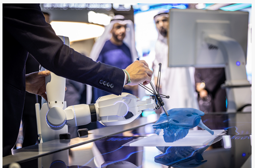
Healthcare Transforming Technologies shown at Arab Health Medical Expo 2023

About GCAP Group: GCAP Group is an innovative social enterprise formed by trusted partners including top bankers, global financiers, infrastructure funds, pension funds, funds of funds, sovereign wealth funds, charitable and humanitarian funds. GCAP's core mission is to advance new frameworks for science, technological innovation, and policy development to address global challenges related to global supply chains, healthcare, climate change, and social equity. GCAP is composed of more than 400 members in more than 40 countries. Our members have influence in many sectors, including logistics, finance, government, manufacturing, banking, insurance, government agencies and industry.