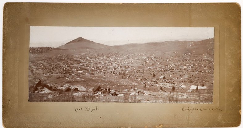
Panorama photo image of Cripple Creek, Colorado, circa 1908, 12 \frac{3}{4} inches by 6 \frac{1}{2} inches and showing the whole town with Mt. Pisgah in the background, in good condition (est. $400-$800).