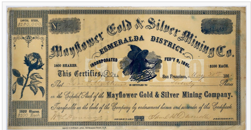
Mayflower Gold & Silver stock certificate datelined 1861 in San Francisco, for 20 shares. Mayflower was in California, Utah or Nevada when it was incorporated (est. $450-$800).