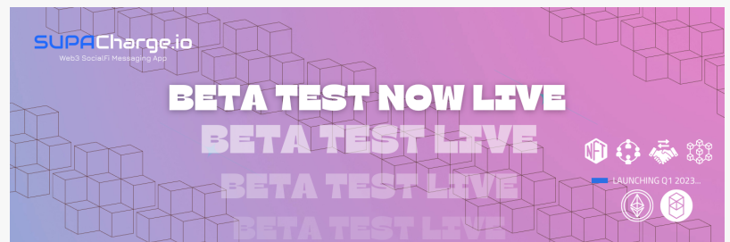
SUPACharge Beta Test Now Live

SUPACharge is to launch on the Ethereum and Fantom chains with plans to expand to Polygon and other chains in Q2 of next year.