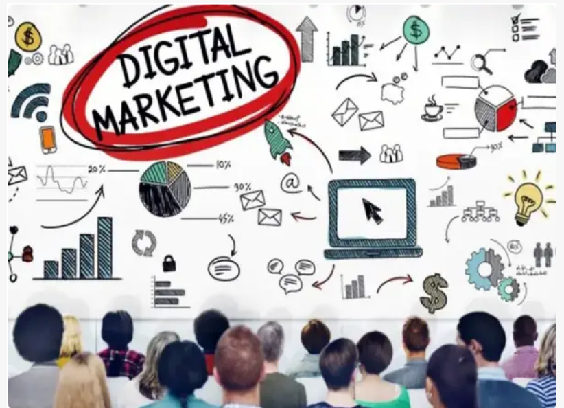
China Marketting Agency

The team at China DoMatters is made up of experts in the field, with a wealth of experience in