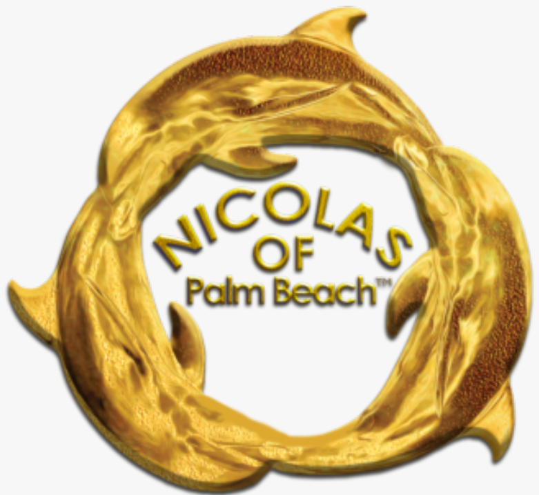
Nicolas of Palm Beach

This press release can be viewed online at: https://www.einpresswire.com/article/616751490