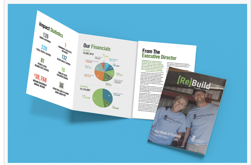
An integrated design system was created to promote brand recall.

Social media campaigns support local and national strategic messaging.