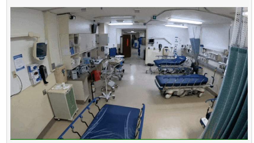
OhmniClean autonomous UV-C hospital disinfection

Expo 2023 in San Antonio, TX, providing attendees the opportunity to experience the cuttingedge OhmniClean technology at booth 628.