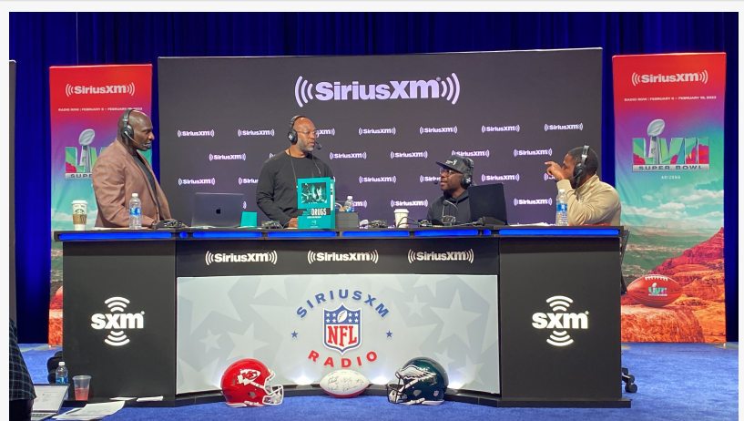
Marshall Faulk on SiriusXM sharing the Drug Free World's initiative and how to learn the truth about drugs

"It is important to me that people learn factual information about drugs," Faulk told his fans. "I want you to do your research and find out everything you can, like what drugs do to your mind and body, and the long- and short-term effects of drugs. So you can make an educated decision about drugs and not give in to peer pressure to use drugs. This is your life. Knowledge is power."