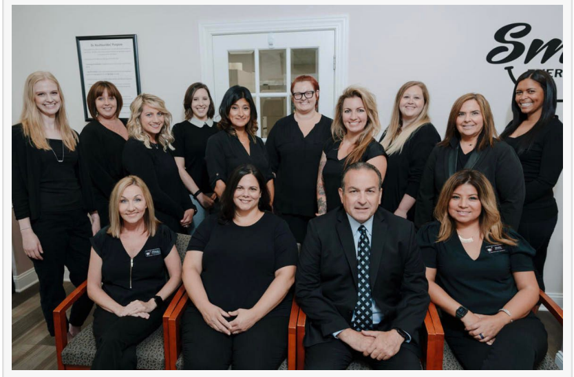
Ridge Dental Care Team

and women as a sweet treat to celebrate Veterans Day.