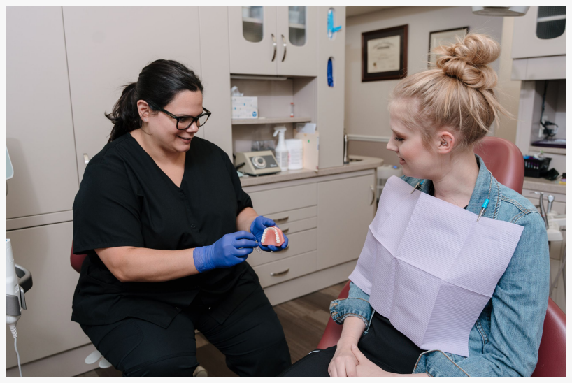
Ridge Dental Care Dentures