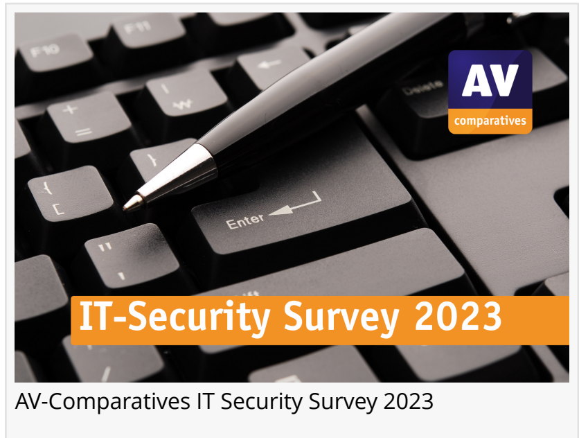
AV-Comparatives IT Security Survey 2023

INNSBRUCK, TYROL, AUSTRIA, February 14, 2023 /EINPresswire.com/ -- Annual IT Security Survey results from AV-Comparatives are a snapshot of the current state of the antivirus sector. The opinions and preferences from the end user community provide us with valuable feedback. The results help to increase the relevance and value of anti-virus software testing.