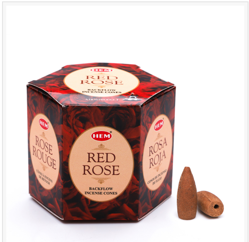
HEM Red Rose Backflow Cones

A celebration of love is incomplete without roses that fills the environment with a charismatic scent. Its sweet floral essence makes it a refined and soulful occasion. Add a touch of elegance to the romance with our classic HEM red Rose Backflow Incense Cones. Backflow incense cones work by allowing smoke to flow downward, creating a beautiful waterfall-like effect. The smoke mimics the appearance of cascading rose petals, creating a stunning and romantic visual display. The incense cones also release a sweet and fragrant aroma, adding to the ambience of the occasion.