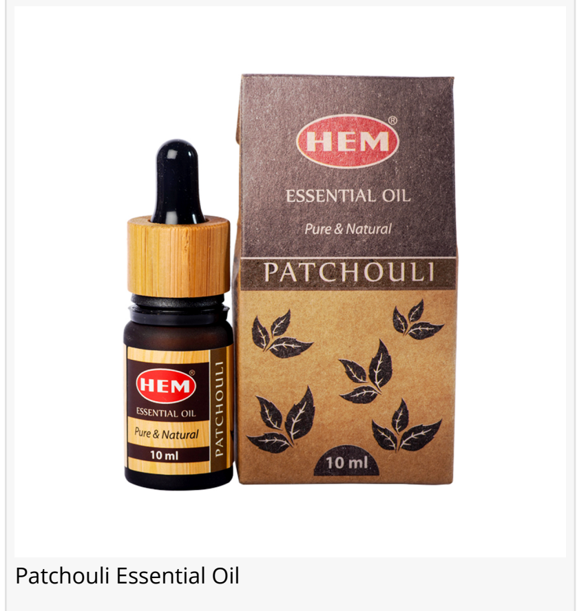
Patchouli Essential Oil

Planning a cosy night in or a romantic dinner for two. Create a relaxing yet intimate atmosphere with the HEM Patchouli Essential oil. It's warm, calming and earthy fragrance when diffused stabilises one's emotions and fills you with positivity. Patchouli has a mood uplifting scent that helps generate a powerful yet peaceful energy that lasts for a long time. The HEM Patchouli Essential Oil creates a magnetic aura while surrounding you with peace and positivity.