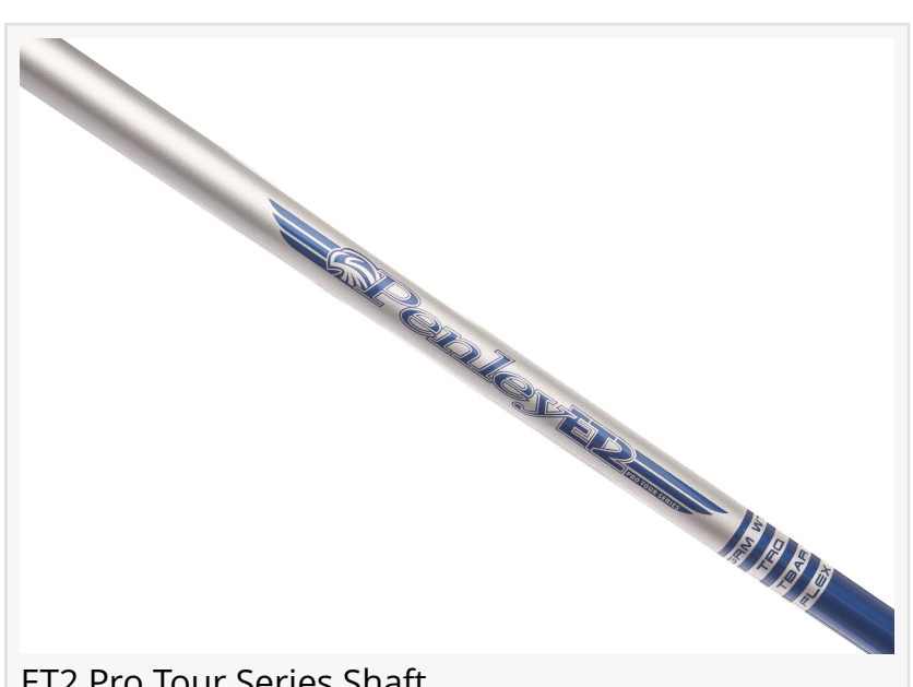
ET2 Pro Tour Series Shaft