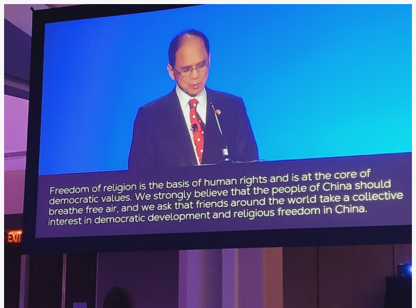
Mr. You Si-kun, Taiwan's Legislative Yuan President, spoke at the Summit live with translation of his speech shown on stage screens