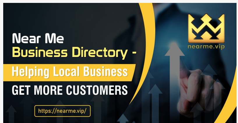
Near Me Business Directory - Helping Local Business Get More Customers