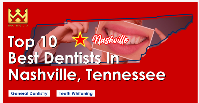
Top 10 Best Dentists in Nashville, Tennessee