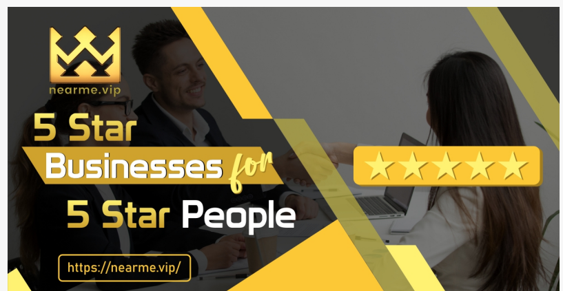
5 Star Businesses for 5 Star People