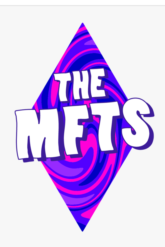
NFT, NFT Collectibles, NFT Stories, Metaverse, Storytelling, The MFTs,

Facebook Twitter LinkedIn Instagram YouTube Other