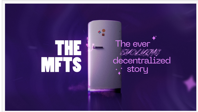
NFT, NFT Collectibles, NFT Stories, Metaverse, Storytelling, Inter-dimensional Fridge, Fridge of the Multiverse, Fridge of the Future, Fridge Portal,

The rise of Web3 has given way to decentralized storytelling, a game changer in the virtual world, made possible by NFTs.