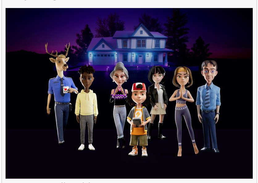
NFT, NFT Collectibles, NFT Stories, Metaverse, Storytelling, The Mansion, Extraordinary Family, Interdimensional Characters, Parallel Universe, Alternate Reality

NFT, NFT Collectibles, NFT Stories, Metaverse, Storytelling, The MFTs , NFT COLLECTION