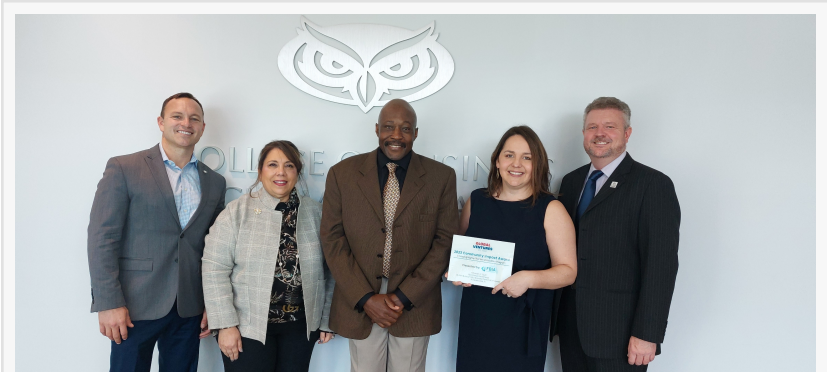
Research Park at FAU governing board accepts the FBIA award