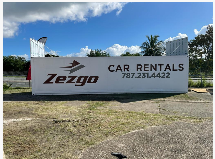
Zezgo Puerto Rico Car Park entrance