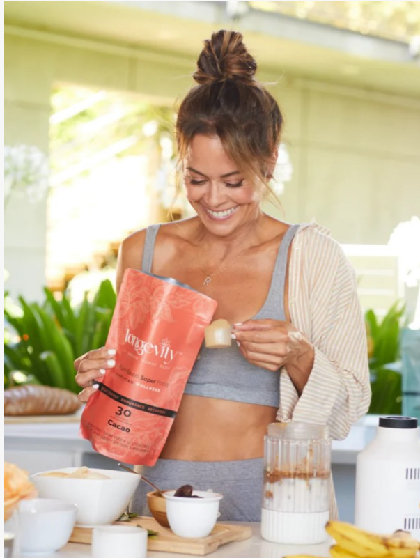
$ZAAG and Longevity Brand Ambassador Brooke Burke