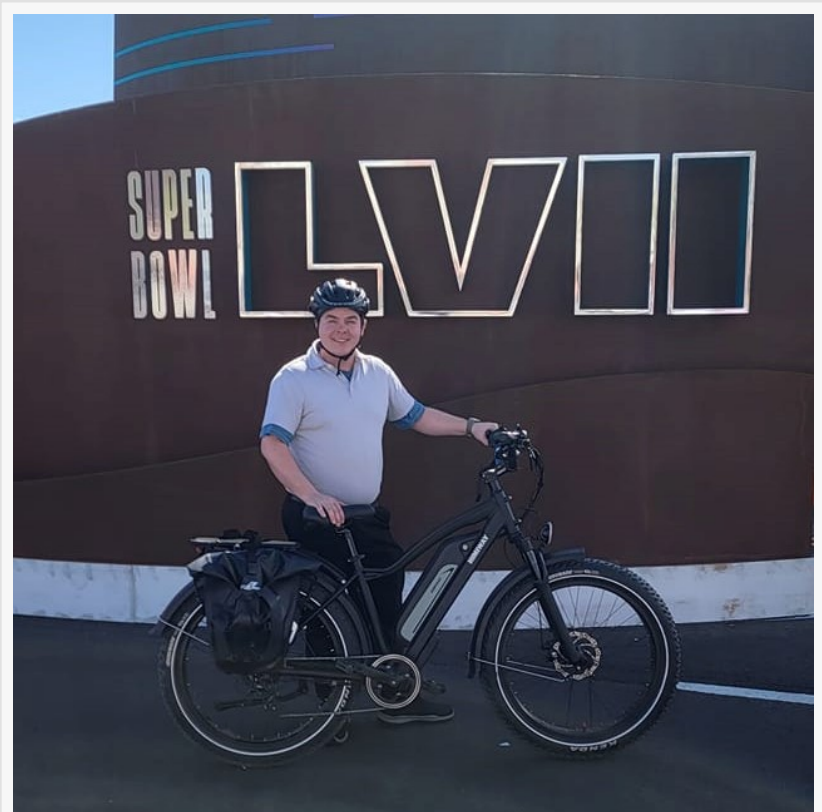
Himiway electric bike

Each member of the Himiway ebike team rode one of the company's latest electric bike models, including the Cruiser, Zebra, and Cobra models.