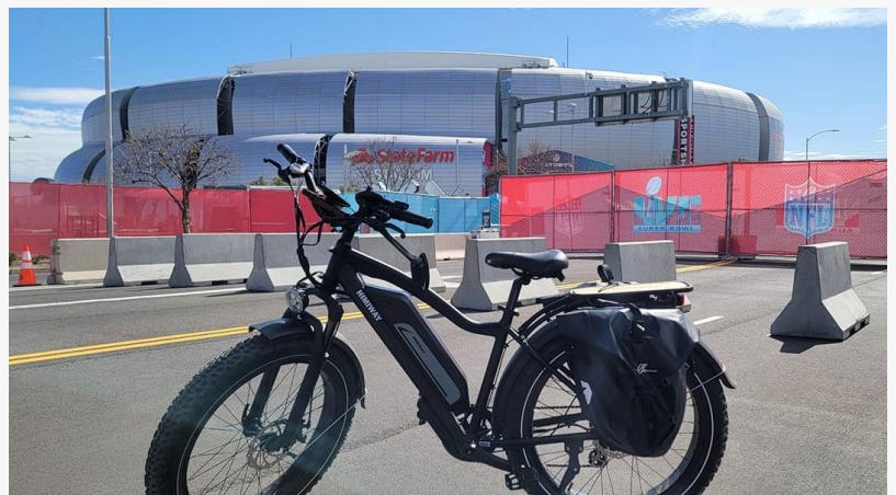
Himiway Bike at 2023 Super Bowl